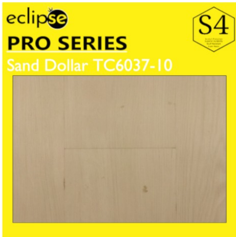
SAND DOLLAR TC6037-10