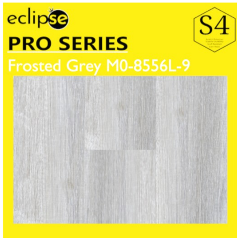
FROSTED GREY M0-8556L-9