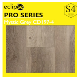
MYSTIC GREY MC8817-04/CD197-4