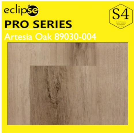
ARTESIA OAK 89030-004