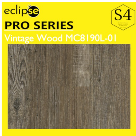
VINTAGE WOOD MC8190L-01