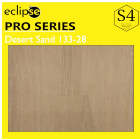
DESERT SAND 133-28