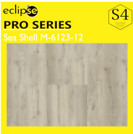
SEA SHELL M-6123-12