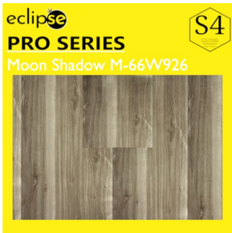
MOON SHADOW M-66W926