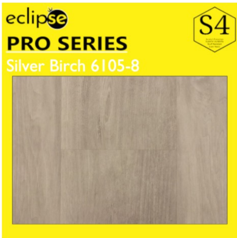
SILVER BIRCH 6105-8