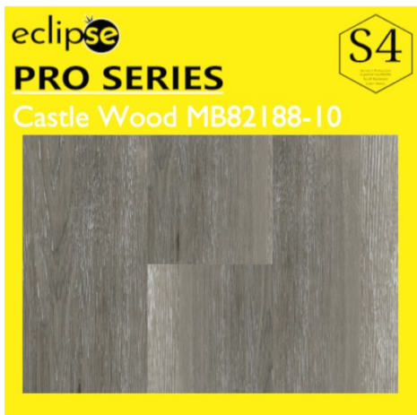
CASTLE WOOD M882188-10