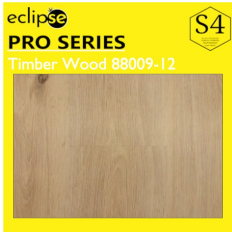
TIMBER WOOD 88009-12