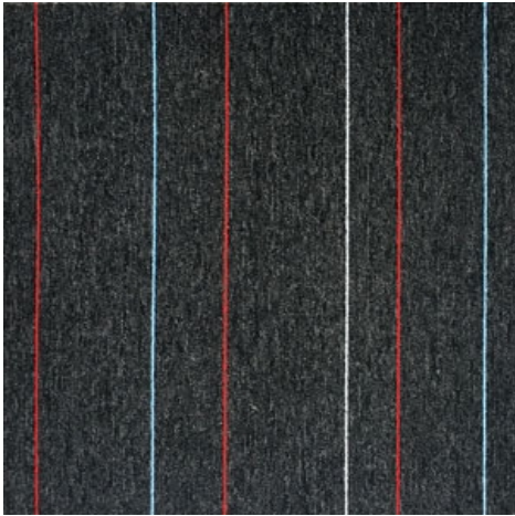
HIT IT BIG LB-05