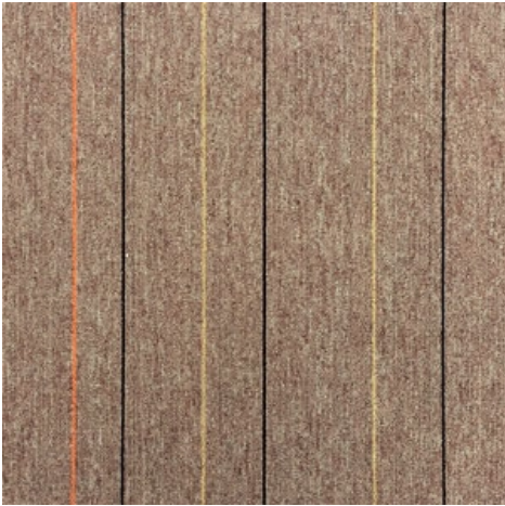
STRIKE IT RICH LB-01